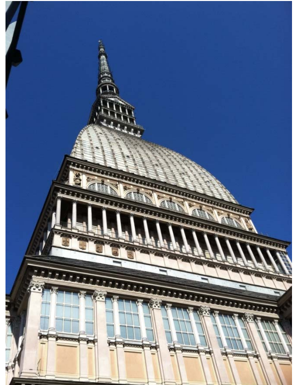
Mole Antonelliana, Torino

The study abroad students from the University of Maryland will team up with students from the Politecnico di Torino to examine and develop “green” alternative solutions for various urban scenarios. The students will be grouped in multidisciplinary working teams involving disciplines such as, civil engineering (materials/ structures), transportation, environmental, urban studies, architecture, other. The faculty involved in the course will identify alternative case studies in the Municipality of Torino with the following characteristics: