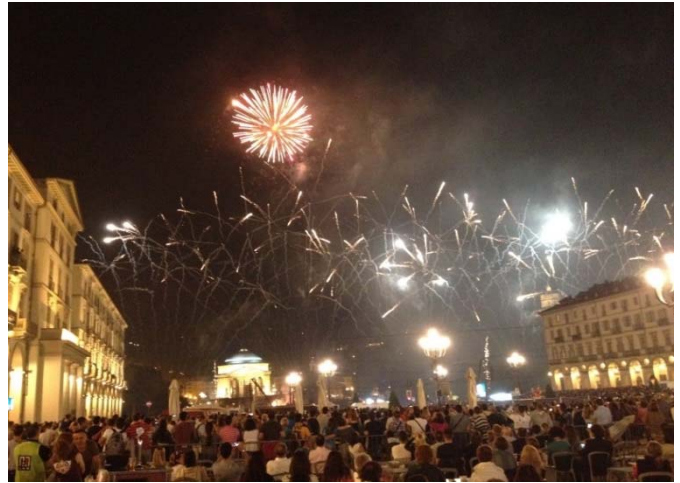
Fireworks at Piazza Vittorio Veneto, Torino.