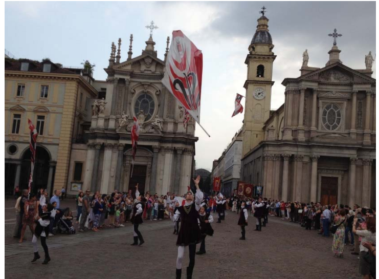
Parade at Piazza San Carlo, Torino.