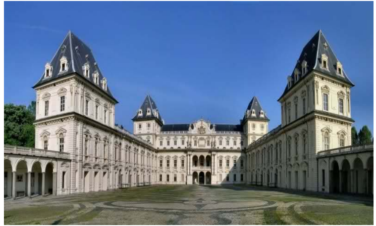
Course Location: Valentino Royal Castle, Politecnico di Torino.