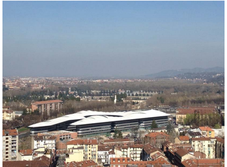
University of Torino