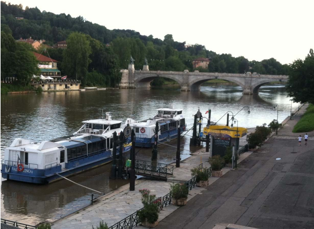
Po River, Torino