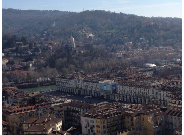
Piazza Vittorio Veneto, Torino.